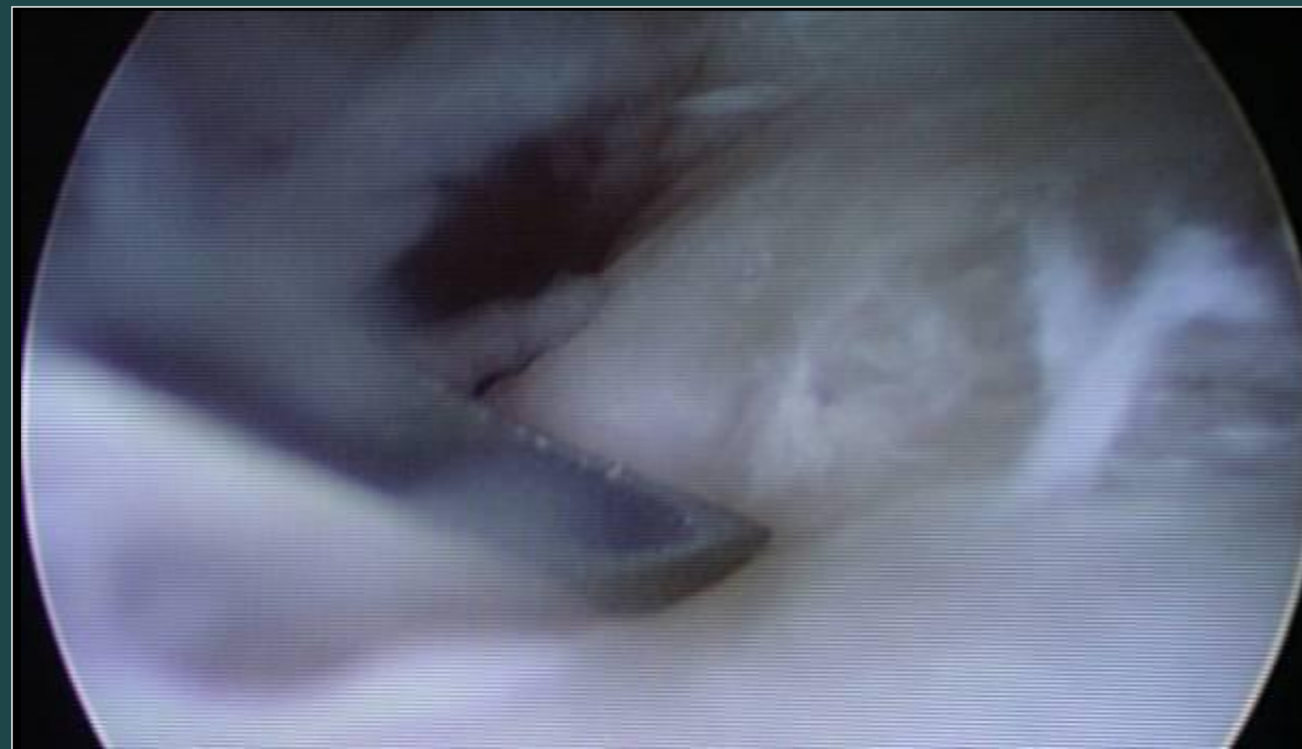
Figure 2: A view through the arthroscope of the lesion being created in the TFCC

Mean, standard deviation, skewness and kurtosis were calculated. Because our analysis showed all data to be normally distributed, standard parametric statistical tests were chosen. Two separate paired Student's t-tests were used to compare UC stiffness and DVRM before and after creation of the TFCC tear.